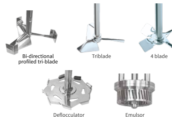
Bi-directional profiled tri-blade

A wide range of agitation to cater for the various types of liquid/solid or liquid/liquid mixing operations.