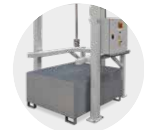
Containment tray for IBC containers